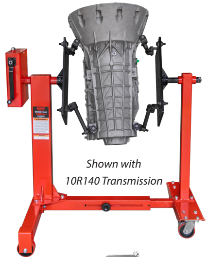
Shown with 10R140 Transmission