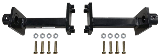
Dodge Cummins 6.7L