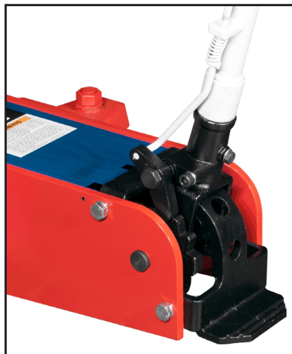
FASTJACK® mechanism raises the jack's lifting saddle to the load in one pump stroke.