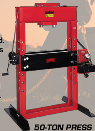
50-TON PRESS (72 3/4" Tall)