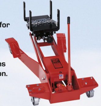
1 1/2 TON CAPACITY

1-Ton Under-Hoist Transmission Jacks Also Available.