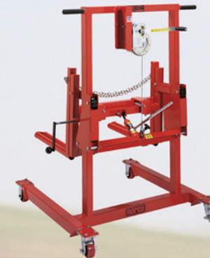
1000 Lbs. Capacity

For the removal & installation of single, tandem and duplex tires and wheels which are mounted on trucks that are supported above ground level.