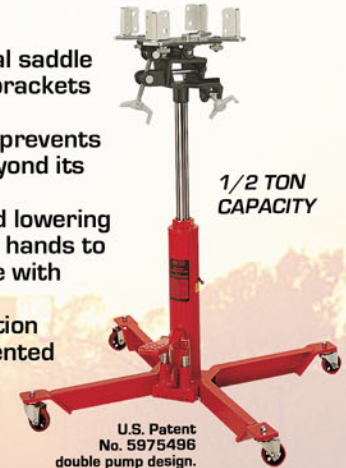
1/2 TON CAPACITY

U.S. Patent No. 5975496 double pump design.