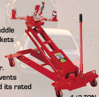
1/2 TON CAPACITY